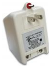
(1) SS105B U.L. Listed 16VAC Plug-In Transformer