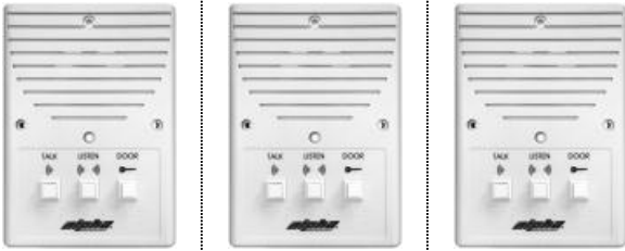
IS204A Inside Surface Mount Stations (White) (qty. of 1 to 8 depending upon kit selected)