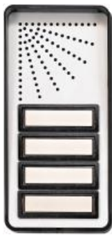
(1) Compact Door Station (supplied with surface back box and integral rain hood) Door Remote Speaker / Panel, with 1 to 4 push-buttons. Model ES04S shown