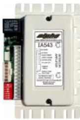
(1) IA543 System Intercom Amplifier