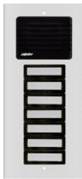
(1) ES612 series Door Remote panel, with 5 to 8 pushbuttons. Model ES612/07 shown (comes with matching surface box/housing)