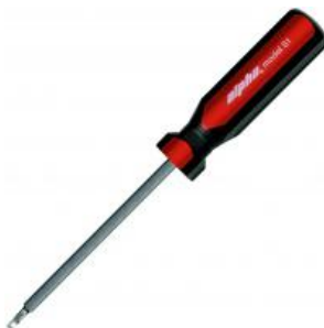
(1) S1 Scrulox Screwdriver (For Installation and Maintenance)