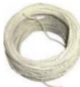
#2PRJ, #3PRJ or #4PRJ or #12WJ Intercom Cable (footage and type depends upon kit model selected). NOTE: 2 conductor #18 cable not included. NOTE: We reserve the right to send in split qtys. where required.