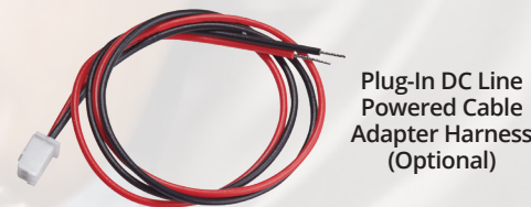
Plug-In DC Line Powered Cable Adapter Harness (Optional)

Ideally Designed For: Retrofit applications where power functionality (battery or hard-wired) offers installation and performance flexibility