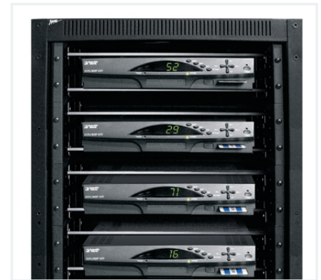
OCAP-3 (shown) uses three space model for greater heat dissipation, use two space model for high density mounting