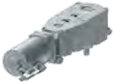
9540-3454 Motor Gearbox