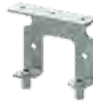
9540-3018 Rear Mounting Bracket