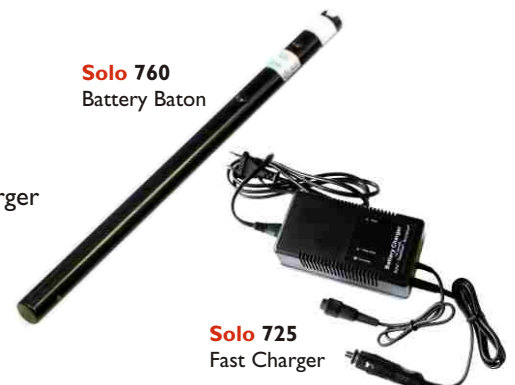
Solo 725 Fast Charger