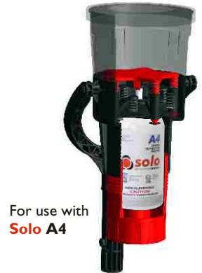
For use with Solo A4

Solo 332 Aerosol Dispenser for larger diameter detectors.