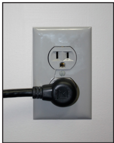
Low-profile, Left-angled plug.