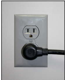
Low-profile, Right-angled plug.