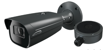
Included Junction Box