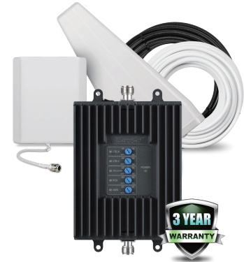
Shown: Fusion Professional signal booster kit