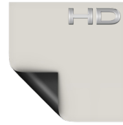
HD Progressive 1.1 Contrast Half Angle: 60° Gain: 1.1