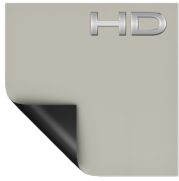
HD Progressive 0.6 Half Angle: 85° Gain: 0.9