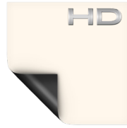
HD Progressive 1.1 Half Angle: 85° Gain: 1.1