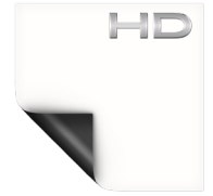
HD Progressive 1.3 Half Angle: 75° Gain: 1.3