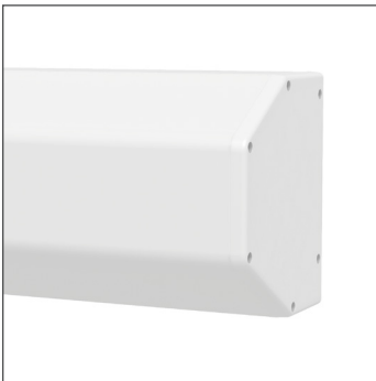
White Case (Standard)