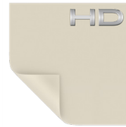
Dual Vision Half Angle: 65° Gain: 0.9