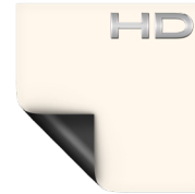
HD Progressive 1.1 Half Angle: 85° Gain: 1.1