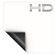
HD Progressive 1.3 Half Angle: 75° Gain: 1.3