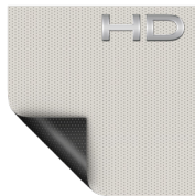
HD Progressive 1.1 Contrast Perf Half Angle: 60° Gain: 1.1