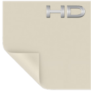
Dual Vision Half Angle: 65° Gain: 0.9