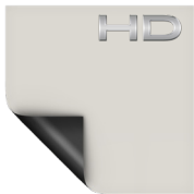
HD Progressive 1.1 Contrast Half Angle: 60° Gain: 1.1