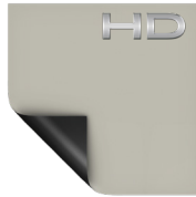
HD Progressive 0.6 Half Angle: 85° Gain: 0.6