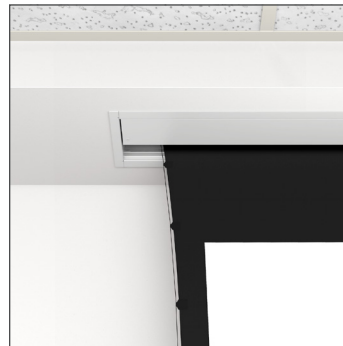
In Ceiling (Open)