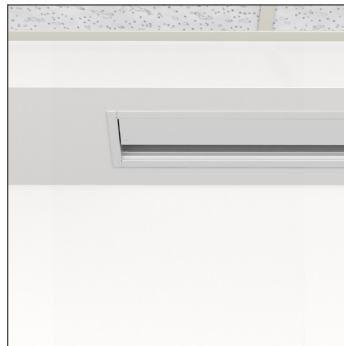
In Ceiling (Closed)