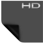
Parallax 0.8* Horizontal Half Angle: 85° Vertical Half Angle: 17° Gain: 0.8