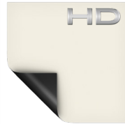
HD Progressive 0.9 Half Angle: 85° Gain: 0.9