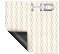
HD Progressive 1.1 Perf Half Angle: 85° Gain: 1.1