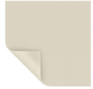
Dual Vision Half Angle: 65° Gain: 0.9