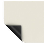
Da-Mat Half Angle: 60° Gain: 1.0