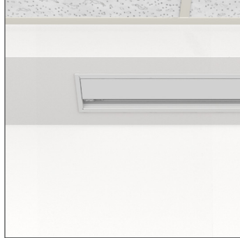
In Ceiling (Closed)