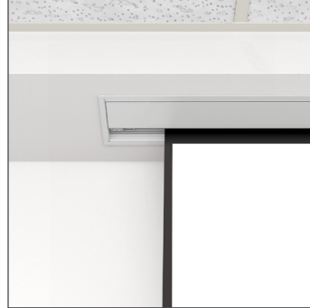
In Ceiling (Open)