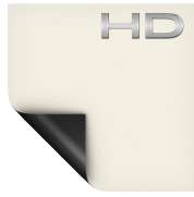
HD Progressive 0.9 Half Angle: 85° Gain: 0.9