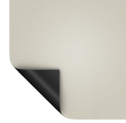
High Contrast Cinema Vision Half Angle: 50° Gain: 1.1