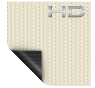
HD Progressive 1.1 Perf Half Angle: 85° Gain: 1.1