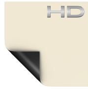
HD Progressive 1.1 Half Angle: 85° Gain: 1.1