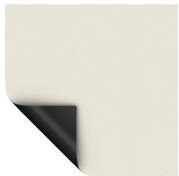
Da-Mat Half Angle: 60° Gain: 1.0