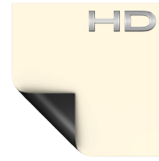
HD Progressive 1.3 Half Angle: 75° Gain: 1.3