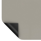
High Contrast Da-Mat Half Angle: 45° Gain: 0.8