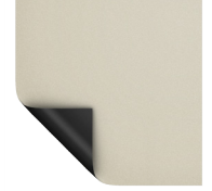
Pearlescent Half Angle: 40° Gain: 1.5