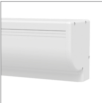
White Case (Standard)