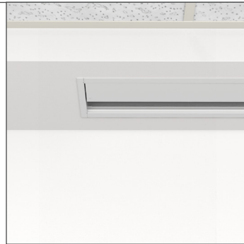
In Ceiling (Closed)