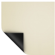
Video Spectra 1.5