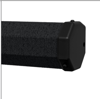
Black Carpet Case