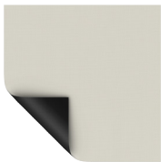
High Contrast Matte White