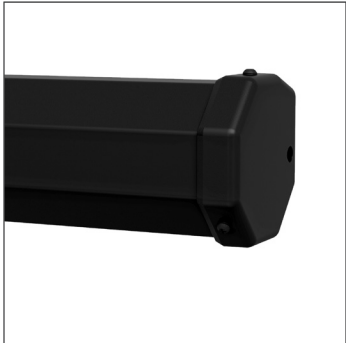
Black Case (Standard)