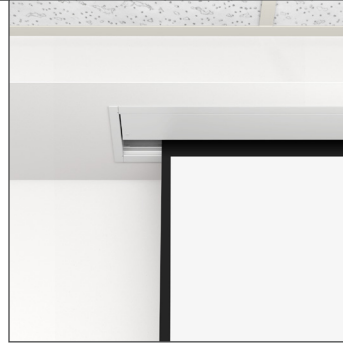
In Ceiling (Open)