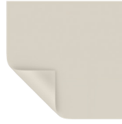
Ultra Wide Angle