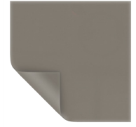
High Contrast Da-Tex