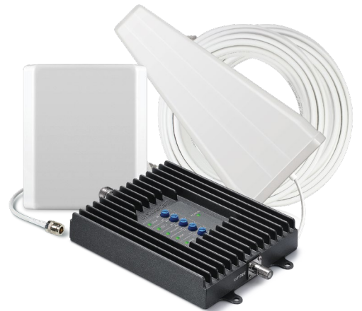
SureCall Fusion4Home Yagi/Panel (SC-PolyH-72-YP-Kit)