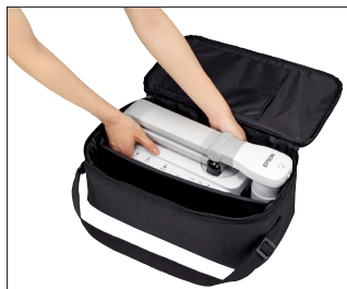
Carrying case included.