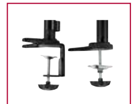
Desk clamp and grommet mount option

■ DESK ASSEMBLY For wood or composite surfaces up to 3" (76mm) thick