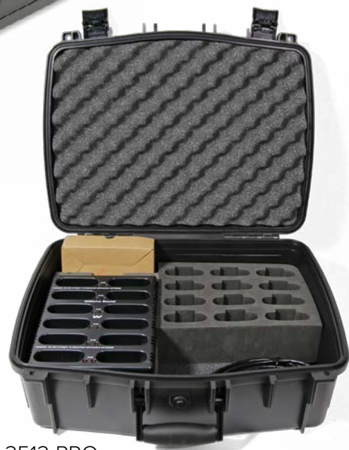
CHG 3512 PRO