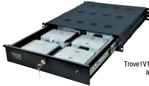
Trove1V1R with six (6) HID Vertx® access controllers