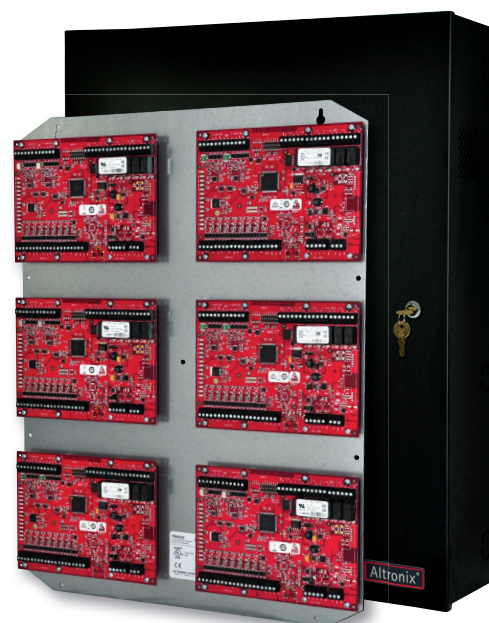
TMV2 with optional Mercury/LenelS2 boards

Altronix TMV2 door backplane for Trove2 and Trove3 enclosures lets you easily integrate Altronix sub-assemblies with Mercury/LenelS2 or HID VertX® access controllers and accessories. Trove simplifies board layout and wire management, reduces installation time and labor costs.