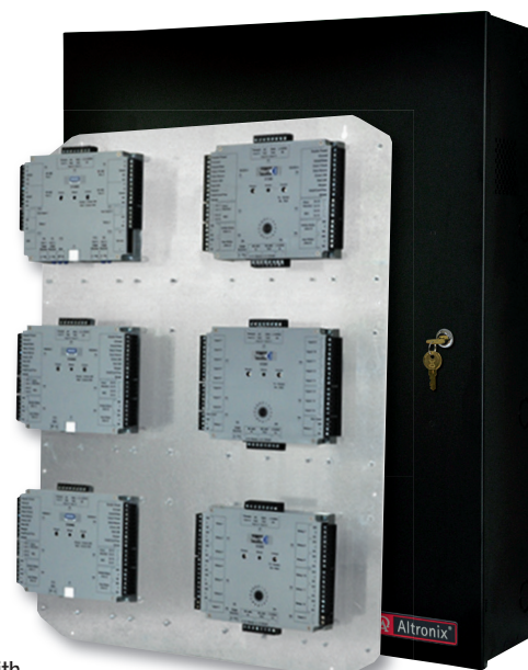
TMV2 with optional HID VertX® boards