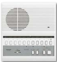
LEF-10S 10-Call Audio Master Station • All Call button (requires BG-10C) • Selective door release • Surface mount 8-1/8" H 7-1/2" W 2-3/16" D