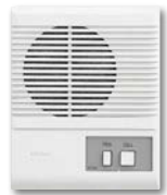
LE-AN Privacy Audio Sub Station • Surface mount • Privacy button 6-1/4" H 5-1/8" W 2" D