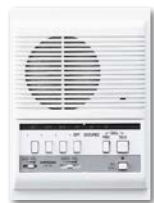
LEF-3C 3-Call Audio Master Station • All Call button (requires BG-10C) • Semi-flush mount 8-1/4" H 6-1/8" W 2" D (9/16" goes inside wall)