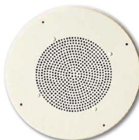
SP-20N/A Ceiling Speaker (requires NP-25V) • 20Ω • Indoor use • Flush mount Diameter: 12-7/8" Baffle Diameter: 8"