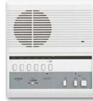
LEF-5 5-Call Audio Master Station • Selective door release • Surface mount 8-1/8" H 7-1/2" W 2-3/16" D