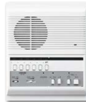
LEF-5C 5-Call Audio Master Station • All Call button (requires BG-10C) • Selective door release • Semi-flush mount 9-7/16" H 7-7/8" W 3" D (1-1/2" goes inside wall)