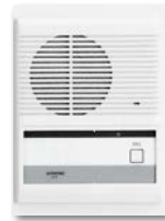
LE-B Audio Sub Station • Semi-flush mount 8-1/4" H 6" W 2" D (9/16" goes inside wall)