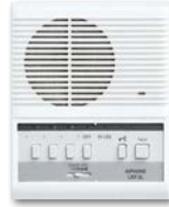
LEF-3L 3-Call Audio Master Station • Selective door release • Surface mount 7-1/16" H 5-5/8" W 2-1/8" D