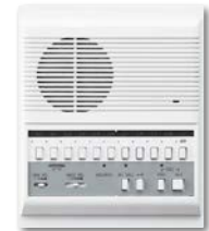
LEF-10C 10-Call Audio Master Station • All Call button (requires BG-10C) • Selective door release • Semi-flush mount 9-7/16" H 7-7/8" W 3" D (1-1/2" goes inside wall)