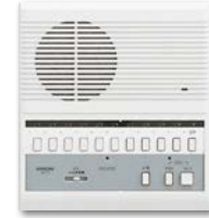
LEF-10 10-Call Audio Master Station • Selective door release • Surface mount 8-1/8" H 7-1/2" W 2-3/16" D