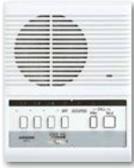
LEF-3 3-Call Audio Master Station • Surface mount 7-1/16" H 5-5/8" W 2-1/8" D