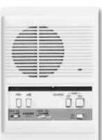
LEF-1C Audio Sub Master Station (requires BG-10C) • All Call button • Semi-flush mount 8-1/4" H 6" W 2" D (9/16" goes inside wall)