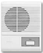
LE-A Audio Sub Station • Surface mount 6-1/4" H 5-1/8" W 2" D