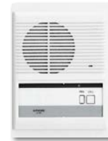
LE-BN Privacy Audio Sub Station • Semi-flush mount • Privacy button 8-1/4" H 6" W 2" D (9/16" goes inside wall)