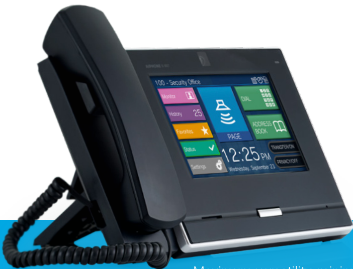
Maximum versatility, minimal clutter IX-MV7-HB | Master Station

The platform for enterprise security and communications that grows with you. It expands your network across multiple security layers for one very powerful solution. No proprietary servers. No annual licensing fees. No need to train your staff on multiple systems. In one building, or across worldwide campuses, the IX Series covers every modern security layer you know about today — and the ones you'll need tomorrow. All with the quality and reliability you expect from Aiphone.