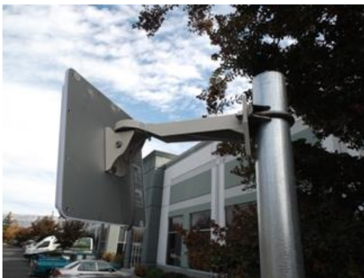
Figure 3. LR-MB with LR-3000 reader, clamped to round pole.