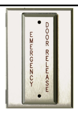
T-STYLE PLATE CLEAR FINISH RED FILL