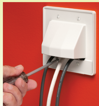
CER2 with Scoop facing OUT. Lower plate secured.

Each of our SCOOPS mounts directly to the wall with drywall screws. For added support, mount to one of Arlington's low voltage mounting brackets; LV1 to LV4.