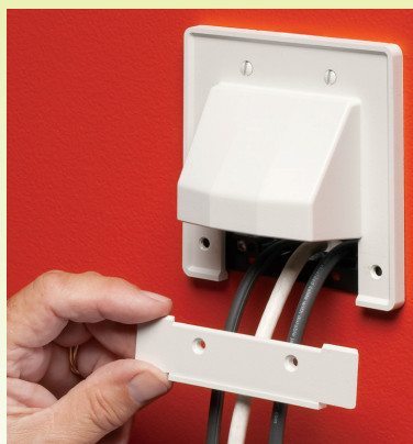
CER2 with Scoop facing OUT. Lower plate removed.