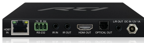
VRX70-18G 4 x 4 4K HDBaseT™ Receiver