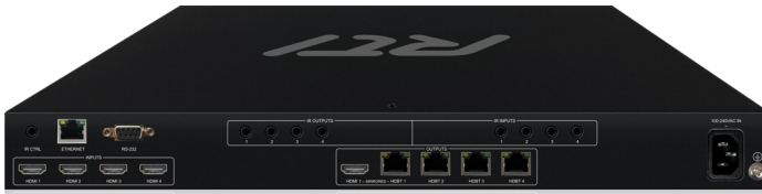
VX44-18G 4 x 4 4K HDBaseT™ Matrix Switcher