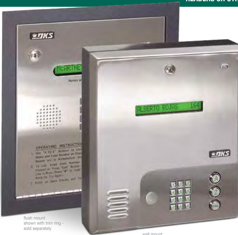
flush mount shown with trim ring - sold separately

BEST SUITED FOR APPLICATIONS REQUIRING CONTROL OF A SINGLE DOOR OR GATE AND IN APPLICATIONS WHERE CARD READERS OR OTHER EXPANSION OPTIONS ARE NOT REQUIRED