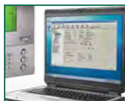
pc programmable easy to use software included