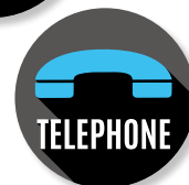
voice and remote programming use DKS service options for connection and programming