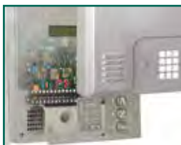
stainless steel plate and anti-vandal features protects all internal parts