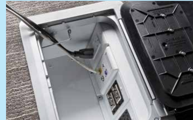
Fully Finished White Painted Interior – Every floor box features a fully finished white painted interior, offering a professional and aesthetically pleasing look.