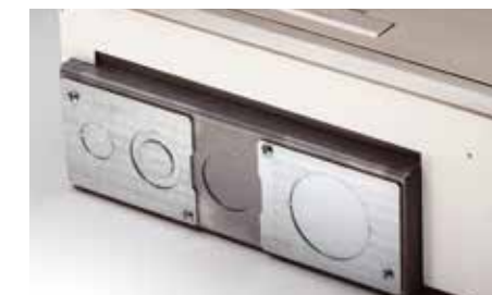
Various Knockout Sizes – The Evolution Series Floor Box knockouts range from 3/4" trade size up to 2" trade size.