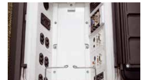
High Capacity – Able to accommodate between four and ten gangs.

Configure an Evolution Floor Box to fit your needs: www.legrand.us/evolution