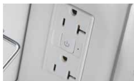
Plug Load Control up to 30 Feet – Tested with Pass & Seymour® Wireless RF receptacles to control plug loads up to a distance of 30 feet when the cover is closed.