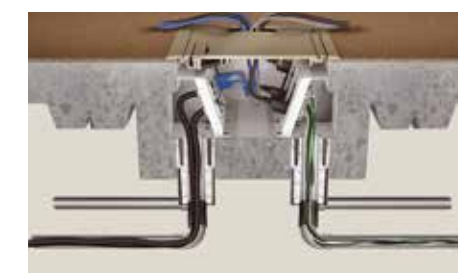
Two Hour Fire Rating – Fire classified for up to two hours and pre-assembled for fast, efficient installation. Just install conduit caps (included), position and secure the box to the desired height in the floor opening.