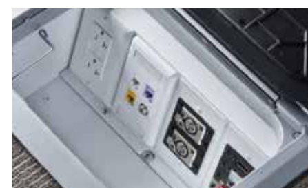
Accepts Standard Size Device Plates – Including single, double and triple standard size wall plates.