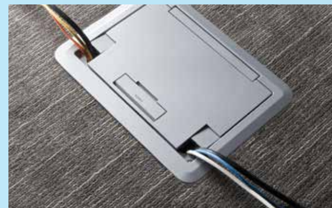
Sliding Doors Reduce Trip Hazards – Auto-close egress doors lock into position when slid open and automatically wrap around cables when the cover is closed, reducing trip hazards.