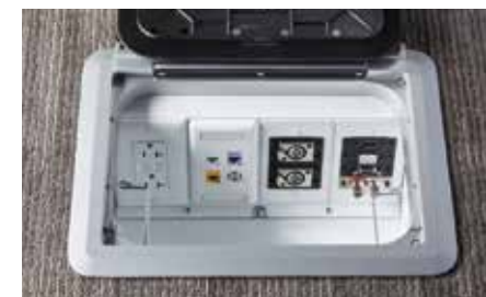
Open System for Flexibility – Accepts a wide range of communications and A/V devices from leading manufacturers.