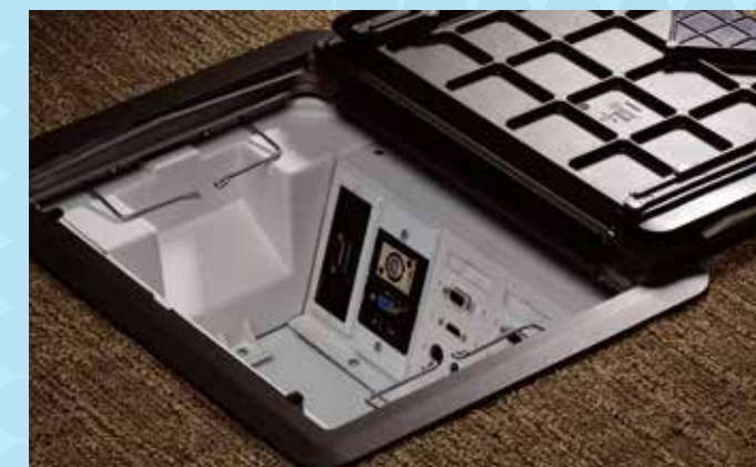
Easy Interior Access – Cover opens 180°, providing easy access when working inside the box.