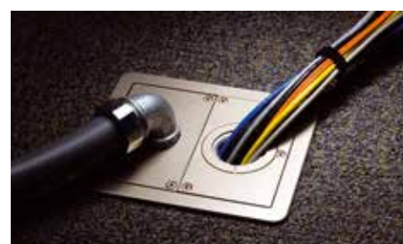
High Capacity Furniture Feed – Boxes are designed for concrete, wood and raised floor applications.