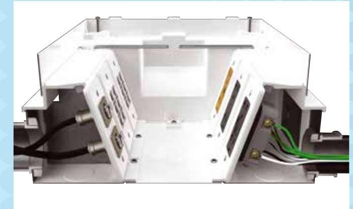
Maximum Depth Behind Modules – All boxes give the end user maximum plug and hand access. There is 3/2" of wire space behind the device plate, offering maximum capacity for the deeper A/V style devices.