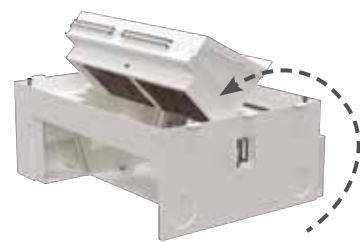
Removable Modules for Easy Changes – For easy installation, moves, adds and changes, modules can be removed out of the top and back. In addition, they can move from point "A" to point "B" without disconnecting services.