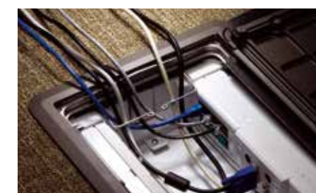
Keeps Cables Organized – Built-in cable management guides keeps cables orderly in the egress location, freeing up one hand when activating devices.