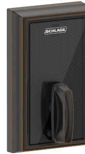
BE467F Schlage Control™ Smart Deadbolt with Addison trim in Aged Bronze