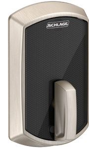
BE467F Schlage Control™ Smart Deadbolt with Greenwich trim in Satin Nickel