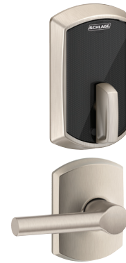
BE467F Schlage Control™ Smart Deadbolt Lock with Greenwich trim in Satin Nickel with Broadway Lever