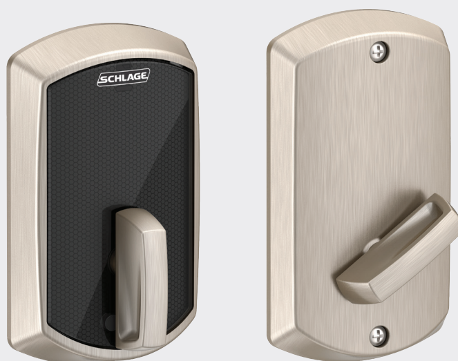
Schlage Control™ Smart Deadbolt with Greenwich trim in Satin Nickel