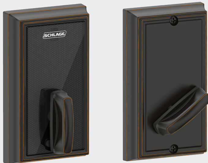
Schlage Control™ Smart Deadbolt with Addison trim in Aged Bronze