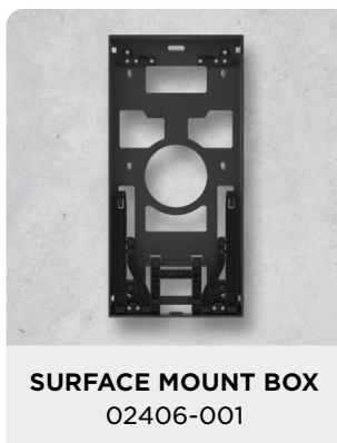
SURFACE MOUNT BOX 02406-001

Intercom dimensions with the surface-mounting installation box