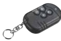
PowerG Wireless 4-Button Key (PGx939)