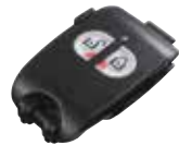
PowerG Wireless 2-Button Key (PGx949)