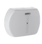
PowerG Wireless Glass Break Detector (PGx922)