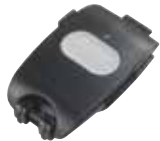
PowerG Wireless Panic Key (PGx938)