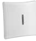
PowerG Wireless Repeater (PGx920)