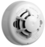
PowerG Wireless Smoke & Heat Detector (PGx936)