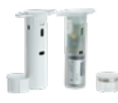
PowerG Wireless Recessed Contact (PGx307TR)