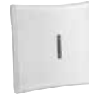
PowerG Wireless Host Transceiver Module (HSM2HOSTx)