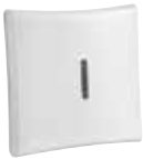
PowerG Wireless Indoor Siren (PGx901 BATT)