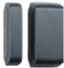
PowerG Wireless Outdoor Magnetic Contact with Auxiliary Input (PGx312)