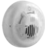
PowerG Wireless CO Detector (PGx933)