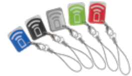
Mini Prox Tag (MPT)