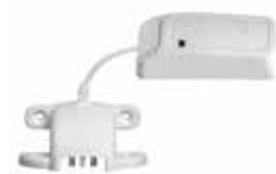
PowerG Wireless Flood Detector (PGx985)