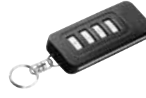
PowerG Wireless 4-Button Key (PGx929)