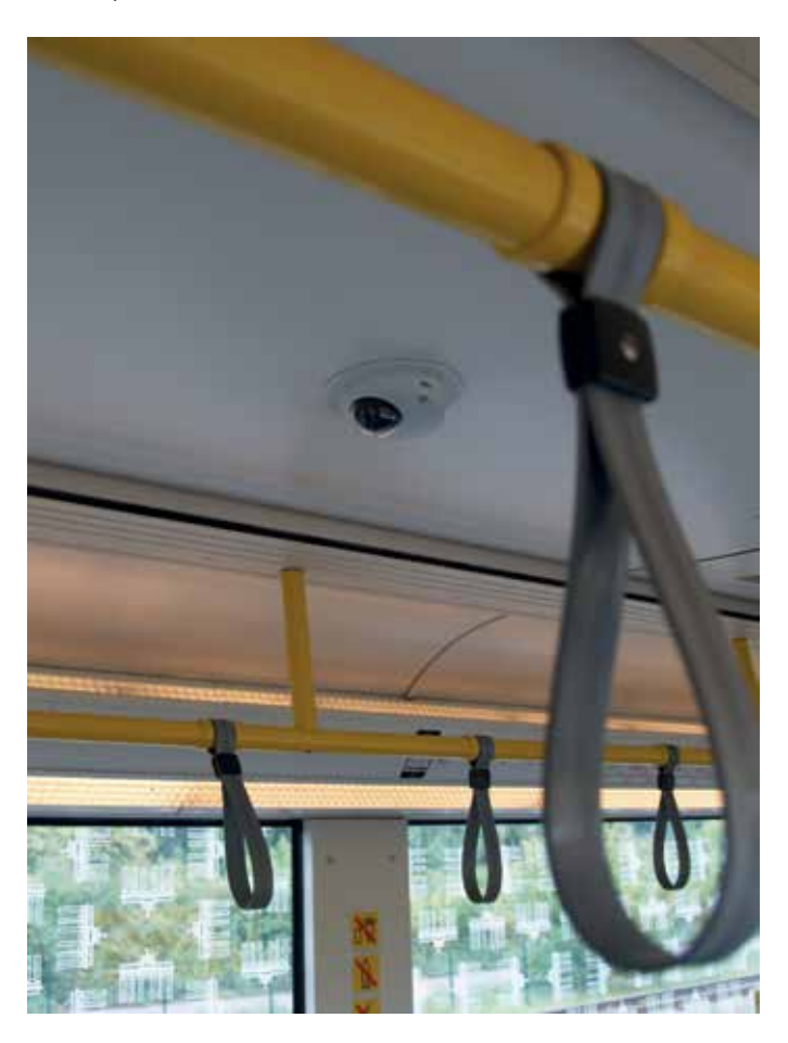
Figure 2: A camera with edge storage in an onboard installation.

Edge storage can manage high-quality video recordings in remote locations and installations where network availability is not constantly available or missing entirely, for example, in mobile surveillance installations, such as on a train. In onboard installations, edge storage can record video when the vehicle is in operation. The recording can then easily be transferred to the central system when the vehicle stops at a depot.