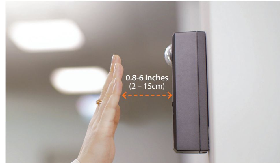
* It also offers a push-button call

The ToF sensor of TID-600R allows touchless call, where users simply present their palm within 6 inches of the station to initiate a call. Touchless system is getting more and more important especially when there's a highly contagious diseases and outbreaks. Keep your staff and visitors safe.