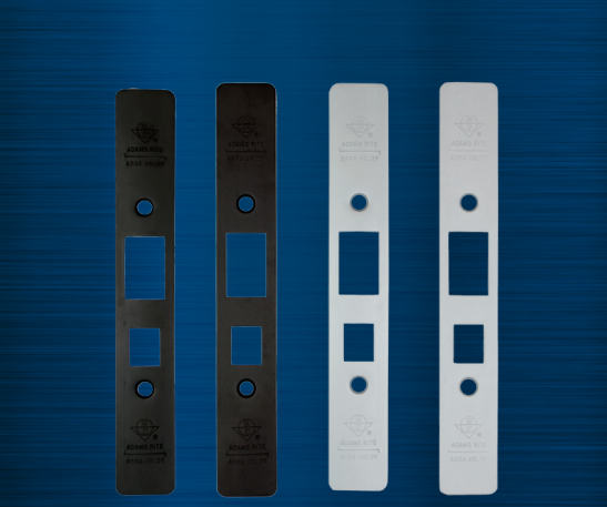
Available as a RITE Pack: Includes 4300 and four faceplates