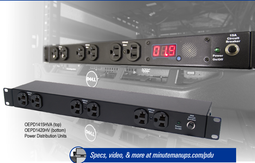
OEPD1415HVA (top) OEPD1420HV (bottom) Power Distribution Units

Minuteman's robust PDU line offers models ranging in capacity from 15 to 30 Amps, in both vertical and horizontal orientations. In addition, select models feature surge suppression and load metering. OEPD power cords are strain-relieved with molded plugs, and use heavy-gauged cables. All models have an external ground stud.