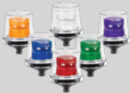
Models 225XST and 225XST-I

Electrarray® Hazardous Location LED Flashing Light