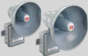
Models 304GCX and 304GCX-CN (15W), 314GCX and 314GCX-CN (15W)

SelectTone® Hazardous Location Amplified Speakers