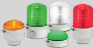
Models SLM100, SLM200, SLM300/350, SLM1400/1450 and SLMBS, SLMBD and SLMBP

Radiant Configurable Stack Light with up to 7 Modules and 5 Mounting Options