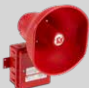
Models ASHH (15W) and ASUH (30W)

Hazardous Location Remotely Selectable Electronic Siren