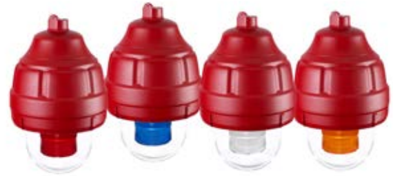
(Shown with pendant mount)