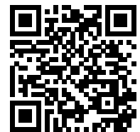
Scan for More