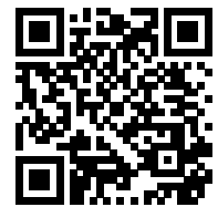
Scan for More