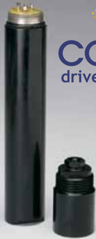
CT-6A Sensor Probe