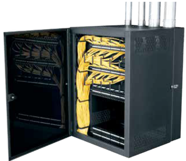
shown with optional offset rackrail