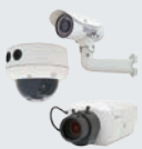
Illustra IP Cameras