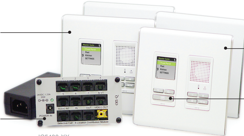
IC5400-XX Selective Call Intercom 4-Location Kit

Installation based on Cat 5 wiring is easy and efficient.