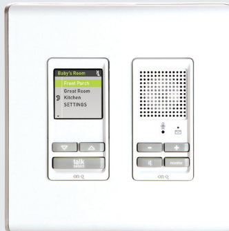
Intercom Room Unit (IC5000-XX)

Built on Cat 5 cabling, the Selective Call System includes convenient RJ45 connections and system auto-discovery.