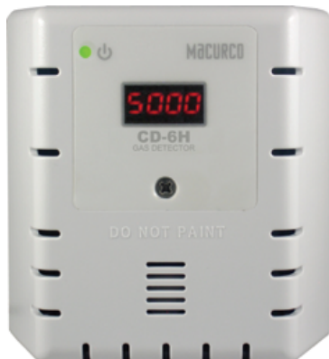
White Housing Option

The Macurco 6 & 12 Series fixed gas detectors provide life-saving solutions aimed to protect people and property. These fixed gas detectors are designed for low level detection, mitigation, and notification. Let these detectors do the work for you by shutting off valves, turning on fans, engaging horns and strobes, and provide notification to fire panels and building automation systems when gases reach key limits.