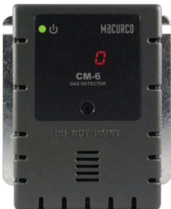
Grey Housing (Standard)