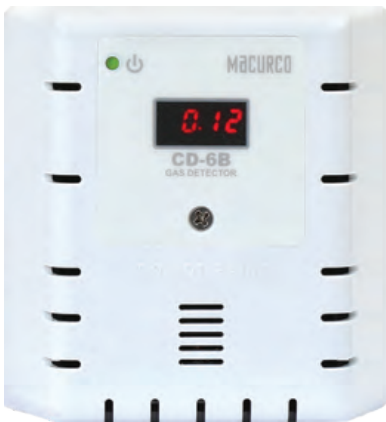
CD-6B Front View

The CD-6B is a low voltage (12-24 VAC/VDC) monitor that provides three alarm levels using three separate relays for controlling external devices. This helps to maintain acceptable levels of Carbon Dioxide in the beverage and food industries, greenhouses, pharmaceutical, and other chemical processing or other commercial applications. The CD-6B can be used as a stand-alone unit or connected to a burglar/fire panel. The monitor has a high range of 0-5% by vol. (0-50,000PPM) with a recommended coverage area of 900 - 5000 sq. ft.