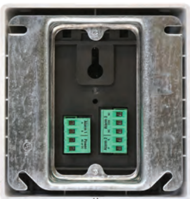
CD-6B Rear View