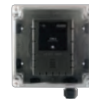
Weatherproof Housing Kit (Detector sold separately)