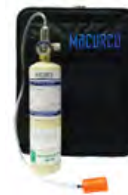
Calibration Kit (Gas sold separately)