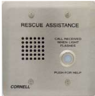
4201B/V Vandal Resistant Call Station with Flush Switch