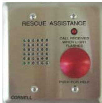
4201B/VM Vandal Resistant Call Station with Mushroom Switch